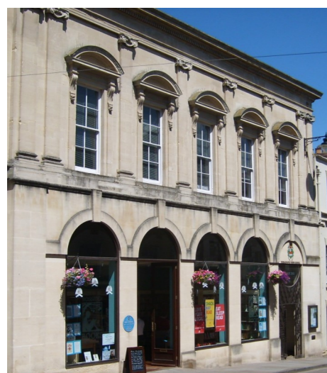
The Corn Exchange is the home of